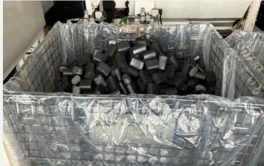
Chips are briquetted and reused as in-house materials