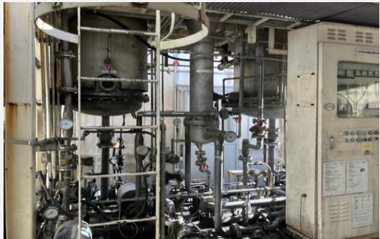
Factory waste is currently used in a concentrator