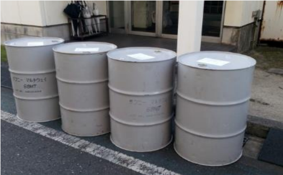
Lubricating oil is recycled and reused