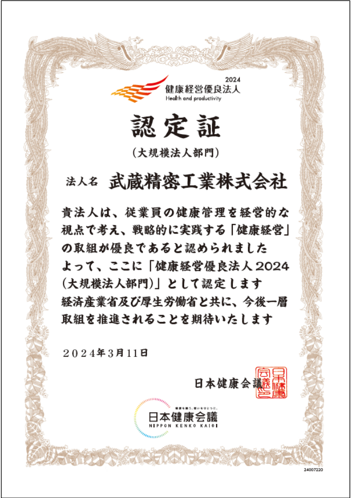
【 Certificate of Excellent Health Management Corporation】