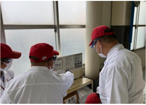
External Review [Third Periodic Review] (February 8 to 9, 2024)