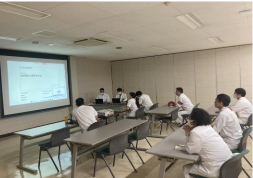
External Audits [2nd Periodic Audits] (August 2 to 4, 2023)