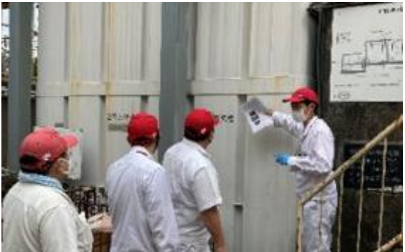
Internal Audits (July 2023 / December 2023)