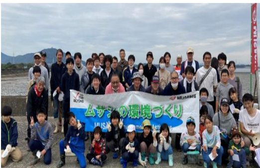
Cleaning Shiogawa Tidal Flat and observing creatures there.(October 22, 2023)