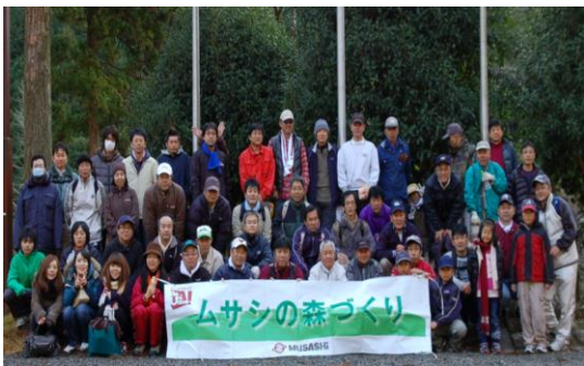
Weeding and planting trees in Aichi Forest (November 12, 2022)